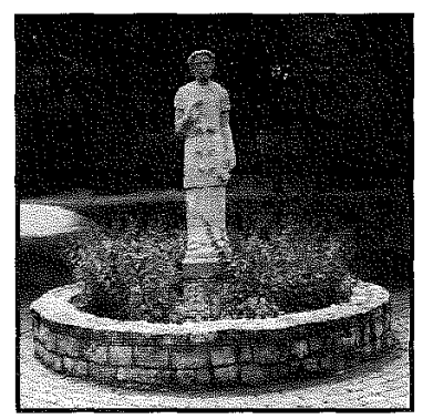
St. Joseph stands proud with repaired head

The students from Watterson are among the nearly 4000 youth who make retreats at Bergamo Center.