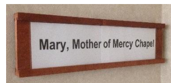
Photos of the newly named Mary, Mother of Mercy Chapel

McNicholas HS Retreat (86) – Jan. 5-6 UD Mission Director (18) – Jan. 7-8 Villa Madonna HS Retreat (30) - Jan. 7-8 St. Francis Men's Retreat (61) – Jan. 8-10 Alter HS Retreat (45) – Jan. 10-11 Evening of Recollection (20) – Jan. 11 Hartley HS Kairos (70) – Jan. 12-15 Bergamo Board (15) – Jan. 14 UD Fellows Rejuvenate (15) – Jan. 15 Shearcroppers Srapbook Retreat (15) – Jan. 16-18 Marianist Founders Reception (150) – Jan. 16 Immaculate Conception, Celina (30) – Jan. 17-18 Mt. Notre Dame HS (60) – Jan. 18-19 CJ HS Kairos (70) – Jan. 19-22 Pre Cana (100) – Jan. 23 Hartley HS Retreat (70) – Jan. 24-25 Moeller HS Retreat (50) – Jan. 25-26 Northminster Presbyterian (15) – Jan. 25-27 Alter HS Kairos (70) – Jan. 26-29 Miami Valley Sewing Guild (24) – Jan. 29-31