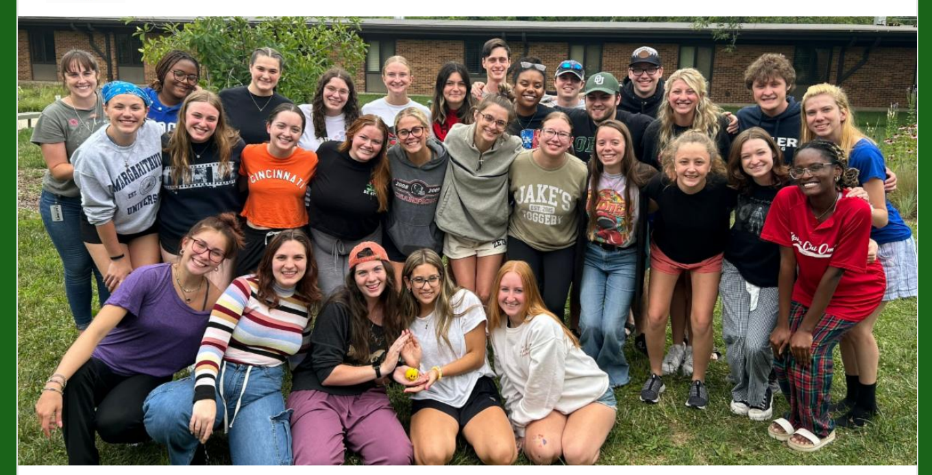
The 2024-25 team of Bergamo Spiritus retreat facilitators.